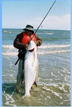
We have some fish stories and the photos to prove them!

We have also included fresh water day trips on the Colorado River. Over the years some faces have changed but the general theme has remained the same; having fun fishing from canoes and kayaks. We fish mostly in saltwater because of our proximity to the bays and Gulf. Kayaks have become the boat of choice because they are easier to manipulate in the often windy conditions along the coast. PACK promotes paddling by attending Kayak Demo Day events and assisting in the maintenance of the TPWD Christmas Bay Paddling Trail.